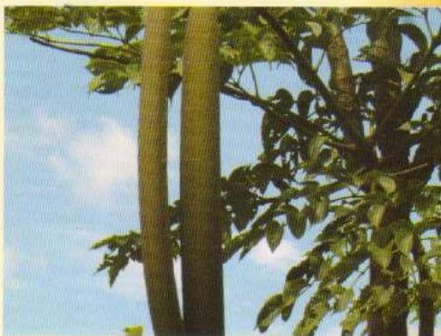
Dzapri ( Oroxylum indicum ) Tree