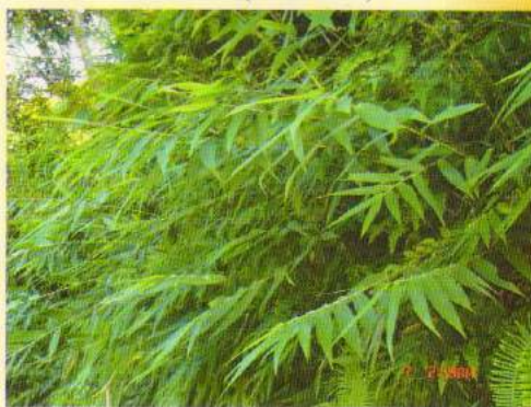
Phegwe ( Thysalona agrostis ) grass/Broom grass