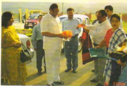
Visit of NRCM campus by Honourable Union Minister of State for Agriculture Mr. Kantilal Bhuria