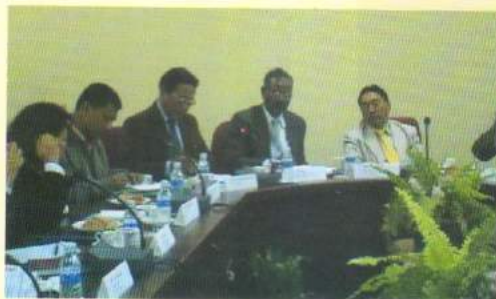
A high level meeting held at NRC on Mithun on 11 th January'2006 to discuss about the arrangement of North East Agri Expo which was held at Dimapur.