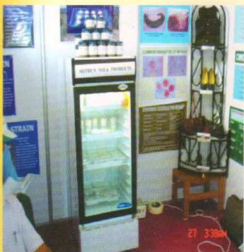
Milk and finished Leather products of mithun are being displayed at NE-Agri-Expo held at Dimapur