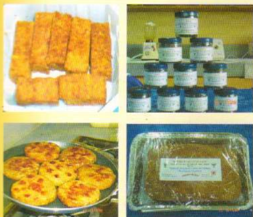
Processed mithun meat products are being displayed at NE-Agri-Expo held at Dimapur