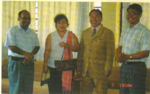
Visit of NRCM by Mr. Thenucho, Honourable Home Minister, Govt. of Nagaland.