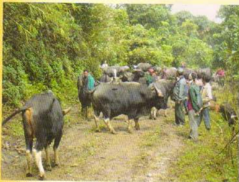
A herd of free-ranging mithun brought to the field for vaccination against FMD

A training programme on rearing of poultry was organized among the villagers of Phek district where various aspects of rearing of backyard poultry was taught to the poultry farmers. Sixty six farmers of Thuvopisumi village of Phek district had participated in the programme