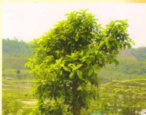
Temichiede ( Ficus hirta ) Herb

Rumen degradation characteristics and effective degradability of dry matter and crude protein of important foliages were studied. The dry matter disappearance of foliages linearly increased as its incubation period in rumen increased. The instantly soluble dry matter fraction of fodder samples was 17.5 and 28.7 percent in Ficus infectoria and Stereospermum chelonoides respectively. The insoluble but degradable dry matter fraction with time was lowest in Sabia sp 26.5% and highest in Emblica officinalis 64.1%. The effective degradability ranged from 27.1- 41.0% among the fodder samples. A linear increase in protein disappearance of fodder samples was also observed with increased period of incubation in rumen up to 72 h. The undegradable protein (UDP) contents of different fodders varied from 55.9 to 73.6 g per 100 g of protein. There was a significant ( P < 0.01 ) negative correlation between effective degradability of dry matter and cell wall content (NDF and ADF). The regression equation showed that, the chemical constituents of different fodders, alone or in various combinations were well correlated with effective degradability of dry matter and crude protein.