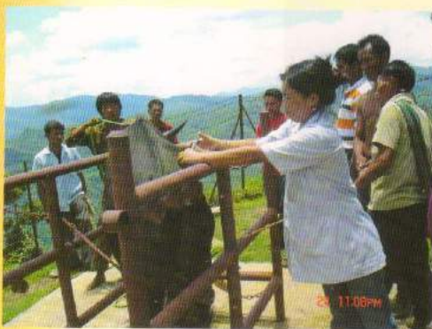
Vaccination of free-range mithuns against FMD at Porba Village

An animal health camp was conducted at Porba village, Phek district of Nagalnd where activities like vaccination of free range mithuns against FMD and deworming of mithuns were carried out. Apart from vaccinating mithuns, blood and faecal samples were also collected from those mithuns for screening against some important diseases.