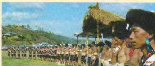
Participation of farmers through their cultural activities in the inaugural function of the KVK at Porba