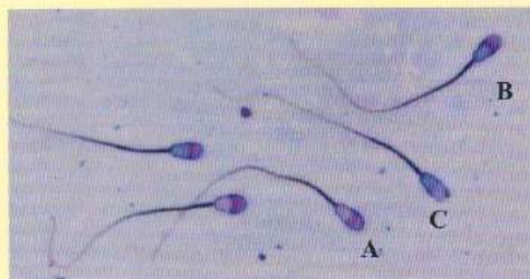
Figure: Light micrograph of mithun spermatozoa after staining with trypan blue and giemsa stains. A: live spermatozoa with intact acrosome, B: dead spermatozoa with intact acrosome, C: dead spermatozoa without acrosome, D: dead spermatozoa with damaged acrosome Magnification \times 400 .

To check the efficacy of the developed cryopreservation protocol, AI was done in three mithuns with cryopreserved semen. Following AI, pregnancy has been established in two mithuns. In conclusion, acceptable level of progressive motility, live sperm count and acrosomal integrity were observed in cryopreserved mithun semen. The results indicate that the developed cryopreservation protocol can be used effectively for mithun semen preservation and subsequent AI.