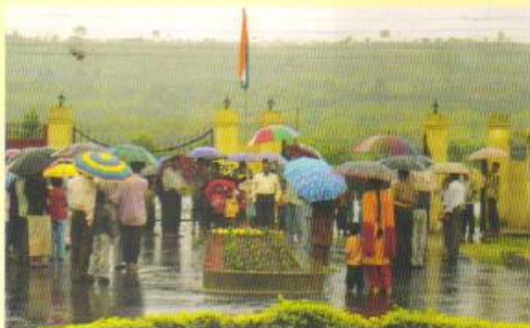
Celebration of the Republic Day

The Republic day was celebrated at the institute with full enthusiasm where all the staff members of the institute participated and children of the staff members took part in many cultural events organized on the day.